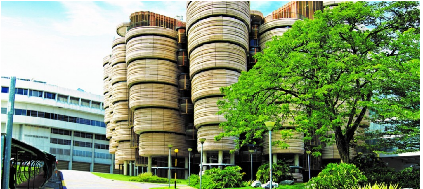
The course at NTU is reportedly over-subscribed.

Initiated by a council under the Ministry of Defence that aims to raise awareness on defence and National Service issues, students discuss issues ( http://news.ntu.edu.sg/Pages/NewsDetail.aspx?URL=http://news.ntu.edu.sg/news/Pages/Media2017_Feb16O2208303.aspx&Guid=c25d03dc-40de-408d-9fa1-ac5910d38c6b&Category=All ) impacting Singapore, such as a rapidly aging society, and rising global competition in a bid to develop strategies and policies relevant to the country's future.